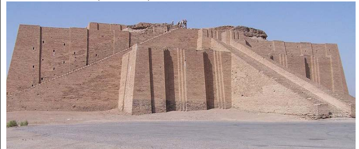
The reconstructed facade of the 4100 year old Great Ziggurat of Ur, near Nasiriyah, Iraq

They said, ... let us build us a city and a tower, whose top may reach unto heaven; and let us make us a name, lest we be scattered abroad (Gen 11:4)